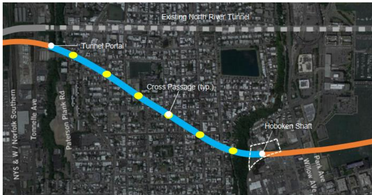
Figure 2: Palisades Tunnel 3

See Appendix 3 (Project Description) for more detailed information regarding the Project, the contemplated Contractor’s scope and responsibilities, future contract packages contemplated to be procured by the Commission to complete the Hudson Tunnel Project, and status of various Project elements.