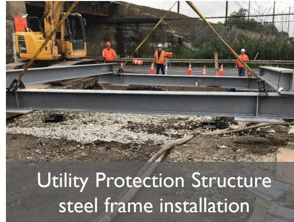
Utility Protection Structure steel frame installation