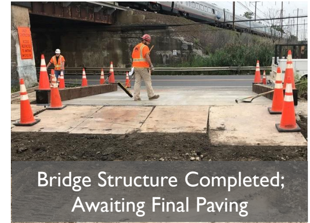
Bridge Structure Completed; Awaiting Final Paving