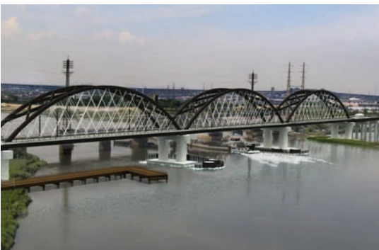
Rendering of future Portal North Bridge.

The Portal North Bridge Project is a key component of Phase I of the Gateway Program, a comprehensive set of strategic rail infrastructure improvements designed to improve current services and create new capacity that will allow the doubling of passenger trains running under the Hudson River.